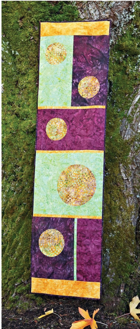
Finished size 16" x 57"

Fast, fun, and easy enough for the confident beginner